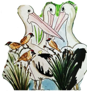
Pelicans & Plum-Headed Finch