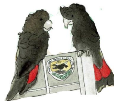
Glossy Black Cockatoo