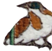
Blue Faced Honeyeater