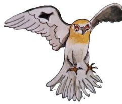
Black Shouldered Kite