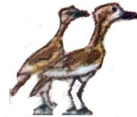
Bush Stone Curlew