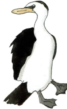
Little Pied Cormorant