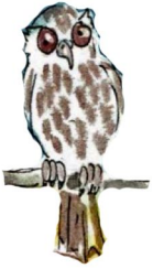
Southern Boobook Owl