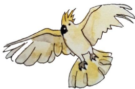
Sulphur Crested Cockatoo